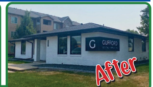
Gufford Dental + Implants