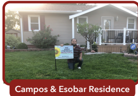
Campos & Esobar Residence